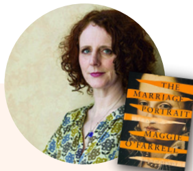
APR. 16-20 MAGGIE O'FARRELL The Marriage Portrait

Hernan Diaz's first novel, In the Distance , was shortlisted for the Pulitzer Prize and Pen Faulkner Award. Trust is under development with HBO and Kate Winslet. Will Hernan Diaz win his Pulitzer this year? We will find out in May.